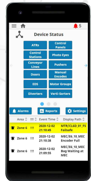
Screenshots of the BHS Map module on the web client and Mobile HMI on mobile to access the BHS network remotely.